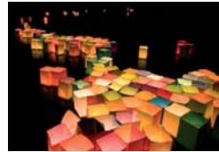
Gill Moore Lantern