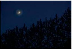
Paul Moffat Night Sky