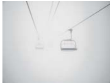
Angus McDonald White Out