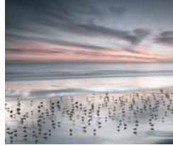
Mark Westerby Sea Birds