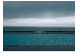
Carl Pinnington Pool